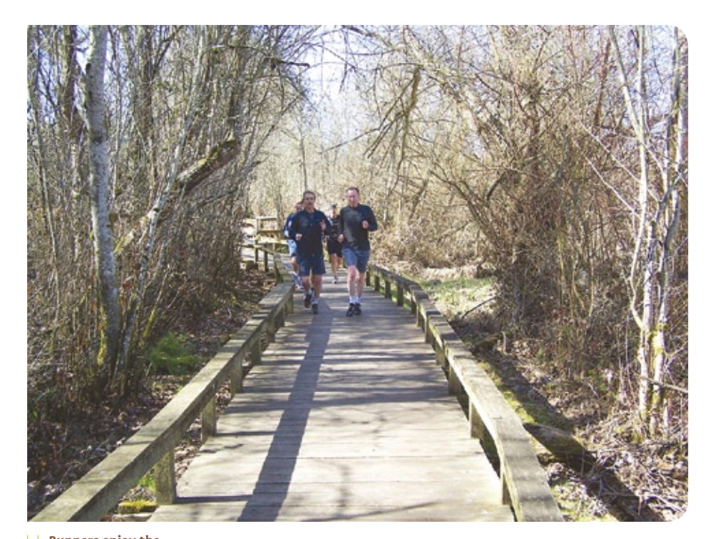
Runners enjoy the boardwalk path at Willow Creek Nature Park on a brisk winter day.

In some ways, THPRD's sizeable accomplishments have led to the Committee's increased attention to specific areas. In their efforts to "hit the ground running" and exceed public expectations, THPRD may have under-estimated some of the complications arising from a project of this magnitude. Adjustments to project timelines reflect some unexpected surprises, but they also reflect appropriate adjustment and recovery. An enthusiastic beginning is to be praised, as long as modifications allow THPRD to regroup and deal with any loose tendrils that may have gone astray. Willingness to make changes that reflect reality, rather than denying real problems, is also a positive sign.