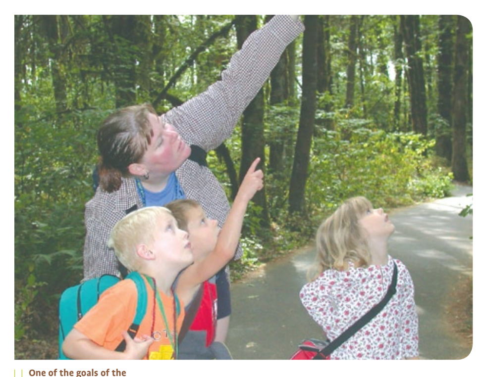
bond measure is to provide sites suitable for more environmental education opportunities for children, like this one at the Tualatin Hills Nature Park.

Since voter approval of the bond measure in November 2008, the projects and facilities promised by the Bond Measure have been the priority of THPRD's Board and staff. They have committed time, energy, staffing, and resources to meeting, and if possible exceeding, public expectations. From the beginning, the Board and staff set priorities and timelines to: (a) structure the bond sale; (b) program and schedule capital improvements and land acquisition; (c) determine the best ways to communicate with area residents; (d) staff project management; (e) determine when and how to hire consulting firms, and (f) structure appropriate contracts.