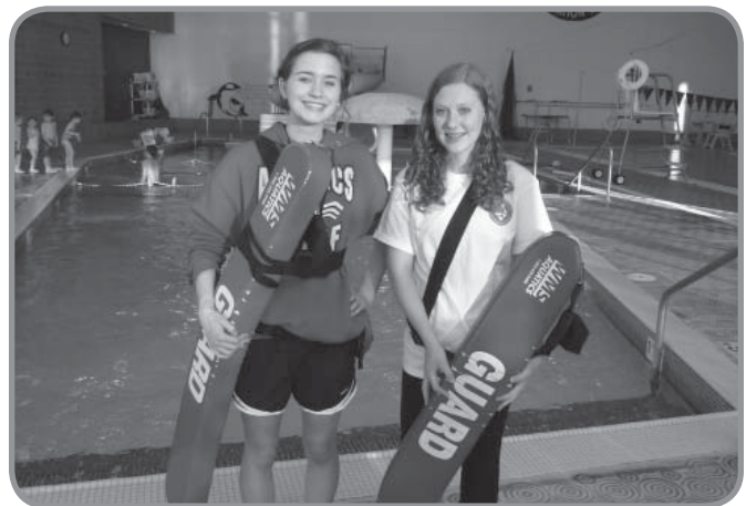
Do you want to be a lifeguard? Join the Conestoga team!