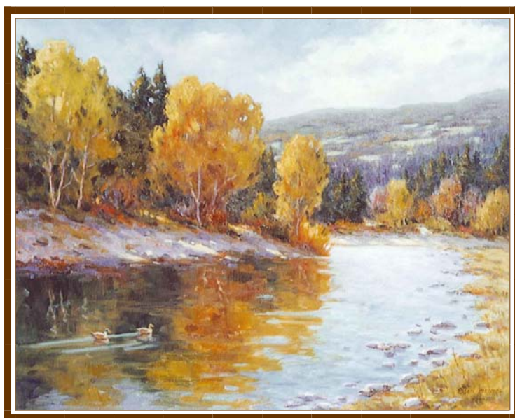
Artist: Ellen Jerome

$5.00 per person 4-day pass & plenty of free parking.