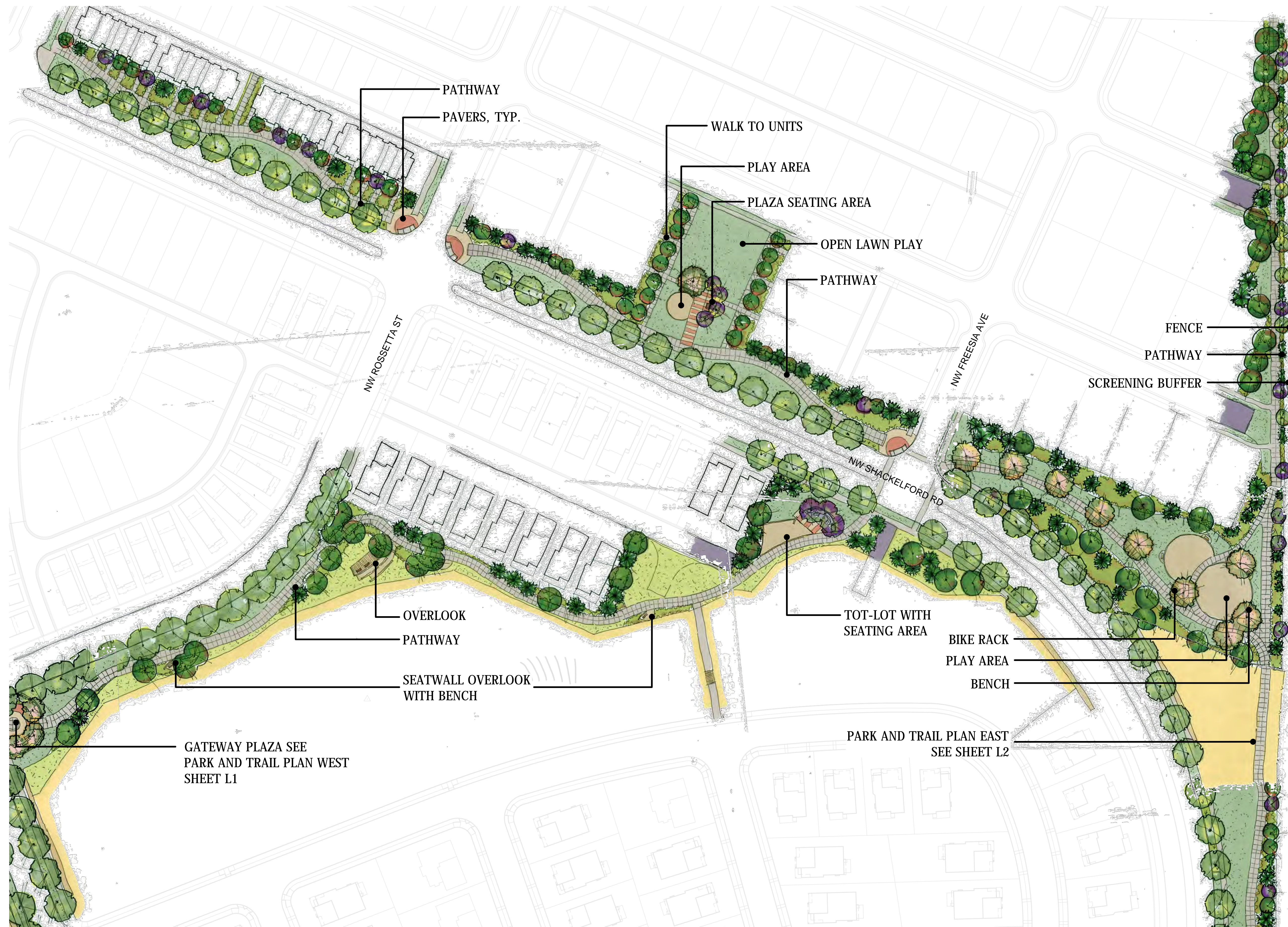
1 PARK AND TRAIL PLAN- NORTH

N:\projects\395-017\09 Drawings\08 Landscapes\Exhibits\395017A-LEX\H103.dwg - SHEET Layout1 Mar 04, 2014 - 12:56pm kei