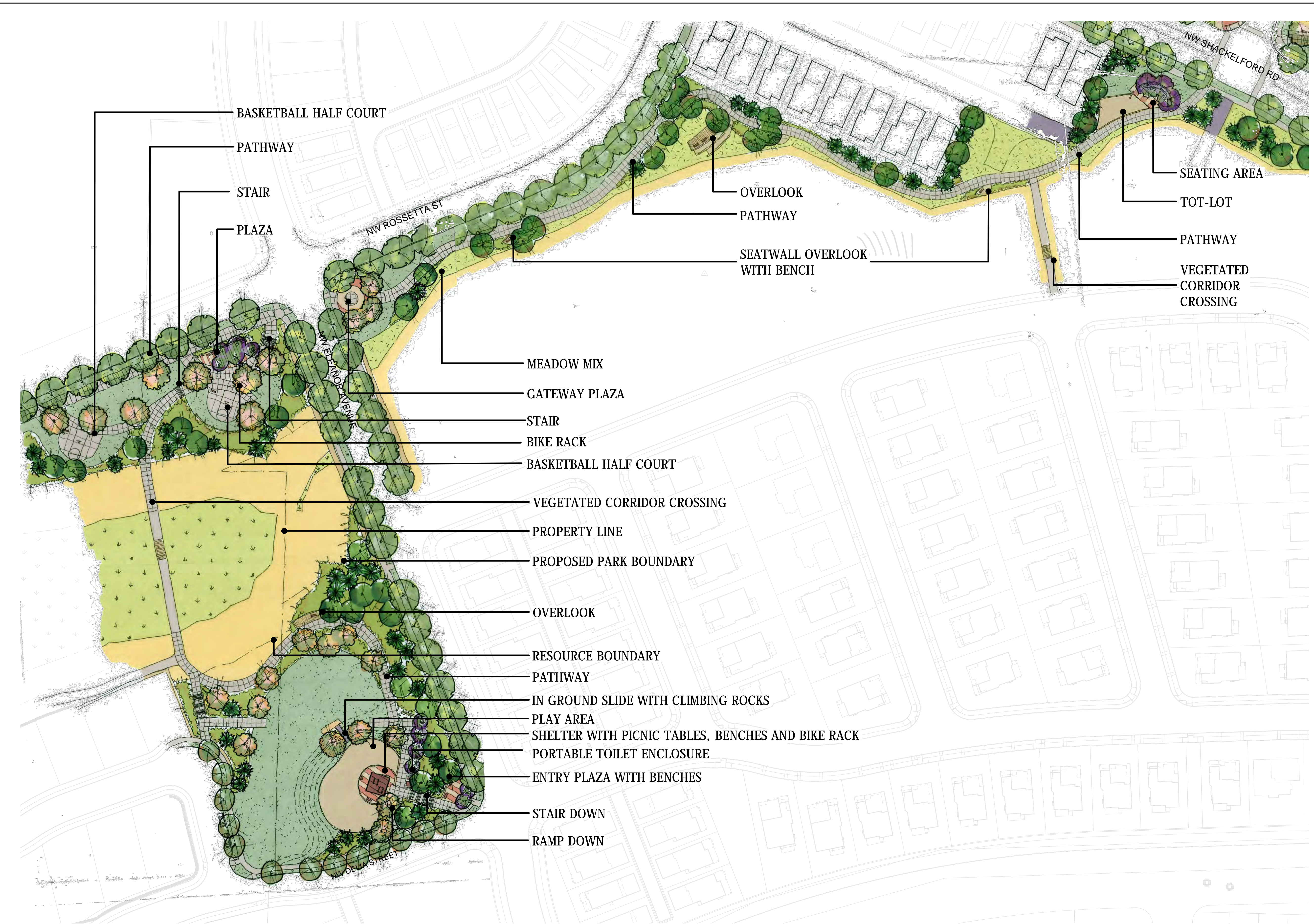
1 PARK AND TRAIL PLAN- WEST

N:\projects\395-017\A\09 Drawings\08 Landscapes\08\08\01\01.dwg - SHEET: Layout1 - Mar 04, 2014 - 12:48pm kel