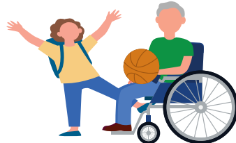
Playing with and for all ages