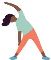
Exercising with a variety of fitness opportunities