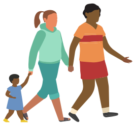
Gathering for picnics, parties, & more

Community members are interested in a variety of activities for the new park.