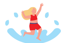
Spaces with water