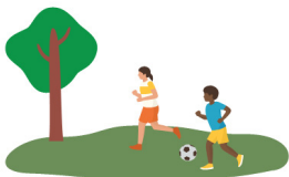
Multiuse open space

Community members are interested in certain types of spaces.