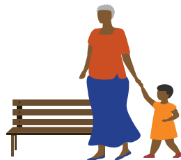
Relaxing with places to sit and rest