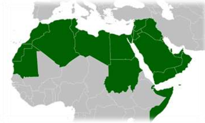
The Arab World map

The Arab world, formally the Arab homeland, also known as the Arab nation, consists of the 22 Arab countries which are members of the Arab League. A majority of these countries are located in Western Asia, Northern Africa, Western Africa, and Eastern Africa